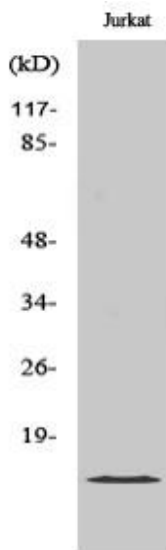
Western Blot analysis of various cells using PHLDA3 Polyclonal Antibody